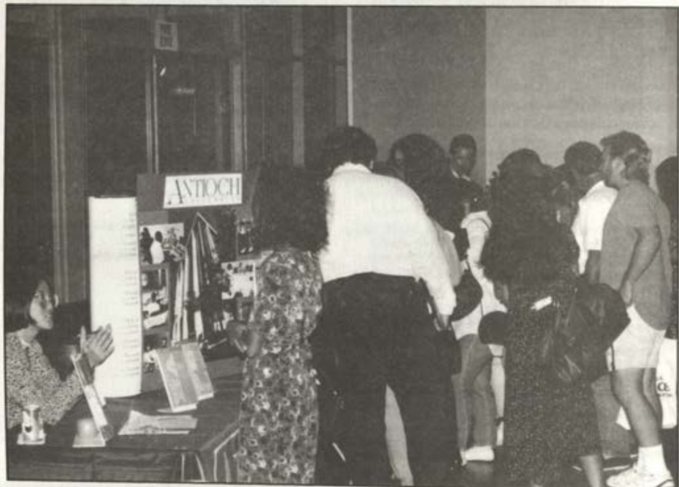
L.A. PIERCE COLLEGE

It is highly recommended that students follow the IGETC transfer plan for either the School of the Arts or the School of Theater, Film and Television. Please see a counselor for preparation for these majors. Admission is very selective. Students should consult with a counselor as soon as possible.